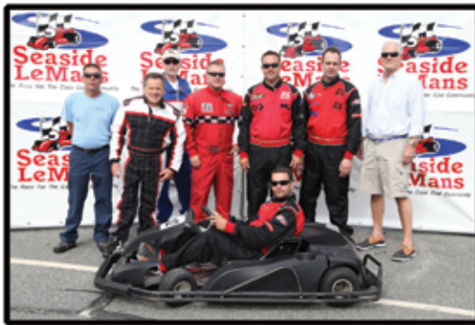
Team photo of Cape Cod Commercial Linen Service and E.J. Jaxtimer Builders, winners of the 2012 Seaside Le Mans

Outer Cape Health Services Hope Hospice Children's Cove Cape Cod Times Needy Fund Cape Cod Healthcare